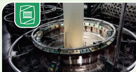
Woven Sack / FIBC