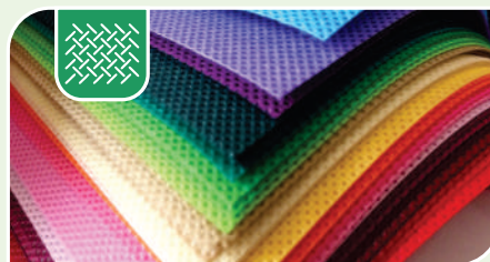
Non-Woven & Technical Textile