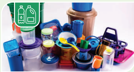
Plastic Mold Items